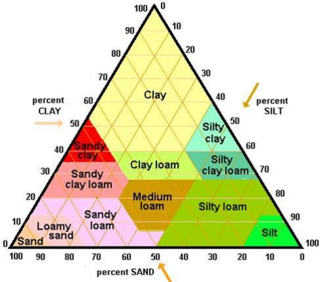
USDA SOIL TEXTURAL TRIANGLE

For design infiltration rates between 0.10 and 0.24 inches per hour, BMP design may include an underdrain placed at the top of the storage bed layer.